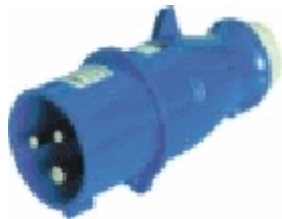
IEC60309 plug (16A 2P+E)