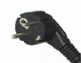
DIN49441 16A plug