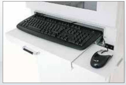
Slide-out section for a keyboard and a mouse