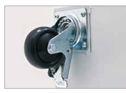
Castors, levelling feet Prepared for mounting castors and levelling feet. Levelling feet are part of the cabinet supply.