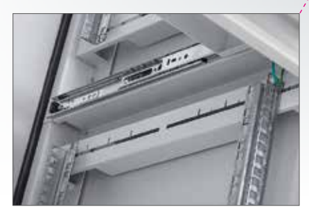
Adjustable vertical rails Vertical 19" rails can be adjusted freely in any depth of the cabinet. This simplifies mounting of devices and configuration of connecting cables.

Multi-point locking of cabinets with high IP rating and door sealing required use a more robust handle. Used handle with lock has a standard Triton universal key.