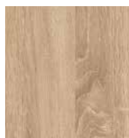
lamine oak bardolino