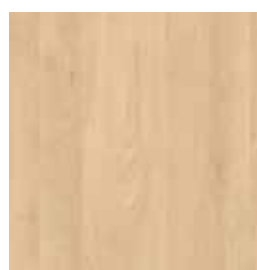
lamine maple mandal